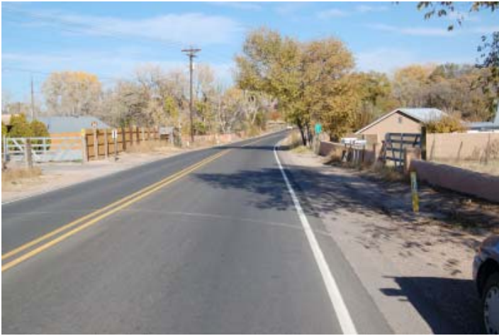
DSC_00670013.JPG Near mile marker 2